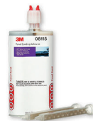
3M Panel Bonding Adhesive MMM 08115 - $47.25 each