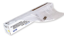
3M Overspray Protective Sheeting MMM 06728 - $55.99 each

While supplies last. See dealer for details. Offers expire 01/31/2025.