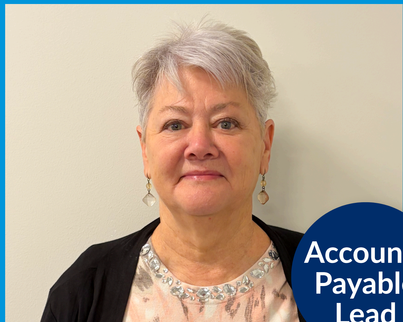
Accounts Payable Lead

How long have you been with the company? 9 years.